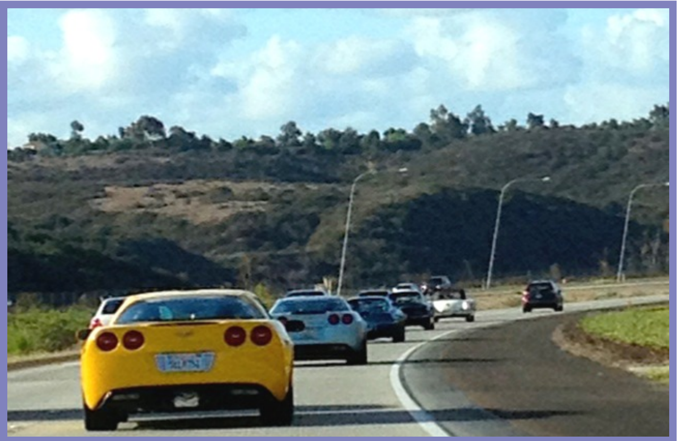
Another beautiful, Corvette filled, fall day in San Diego!